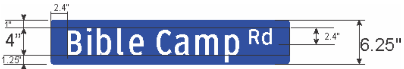
Figure 3 - Typical Sign Layout