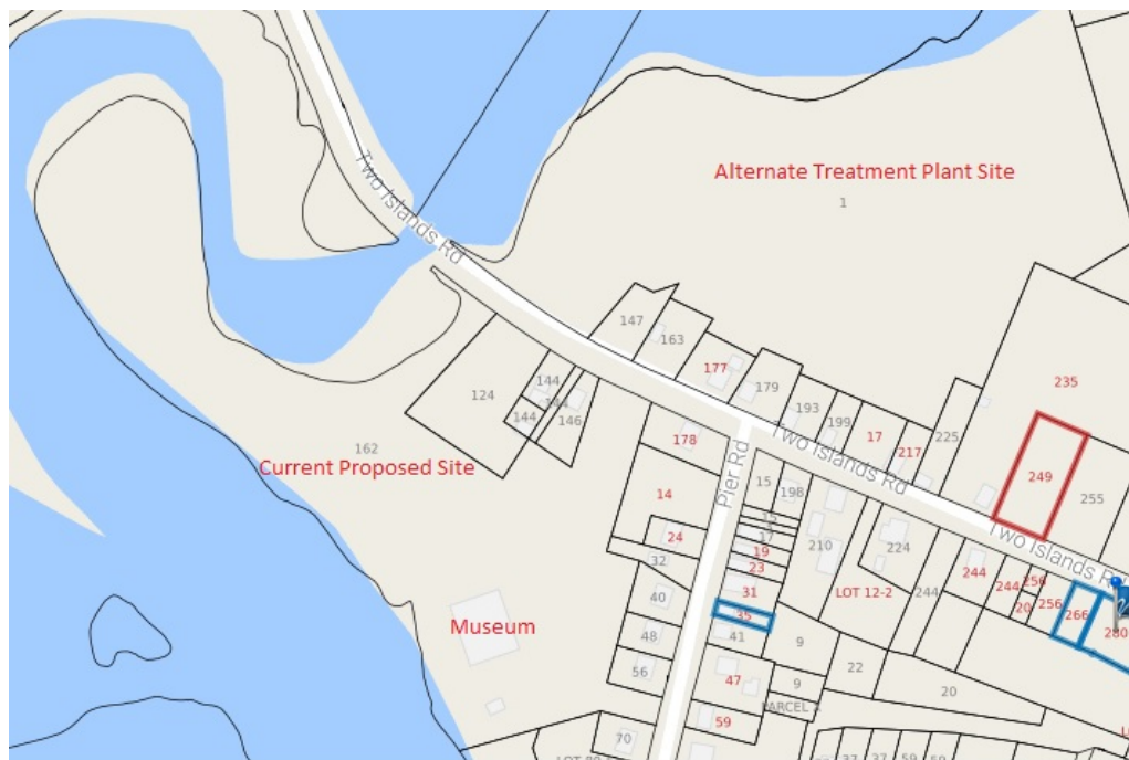
Figure 3 Current and Alternate Sites

The results of the geotechnical investigation have determined that the alternate site has suitable soil conditions to support the construction of a wastewater treatment plant.